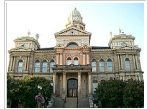
The Belmont County Courthouse in 2009.